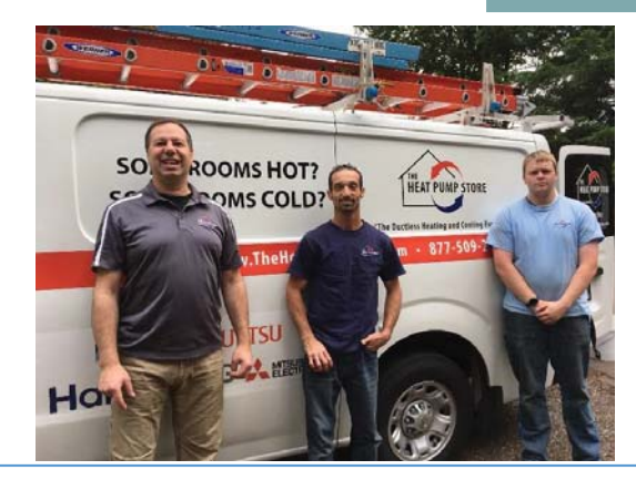
The Heat Pump Store

The process and communication from Craft3 have been great. They keep me informed about how far along in the process my customer is and let us know when we can schedule the installation. I recommend the Home energy Loan at every sales proposal. The customer is excited to learn that they have an option to get the system financed and pay through their power bill.